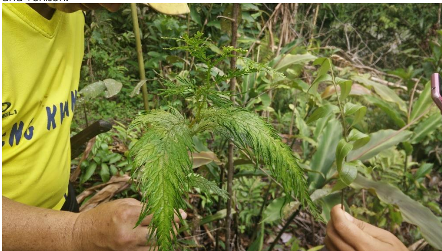
Don gugur ( Selaginella padangensis ) – an indicator plant that the Lun Bawang community uses to identify plots of land with fertile soil that's suitable for hill paddy cultivation.