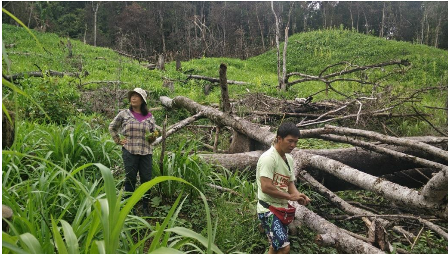
Swidden – trees are cut, left to dry and torched to fertilise the plot to be ready for the cultivation of job's tears, corn and mustard greens