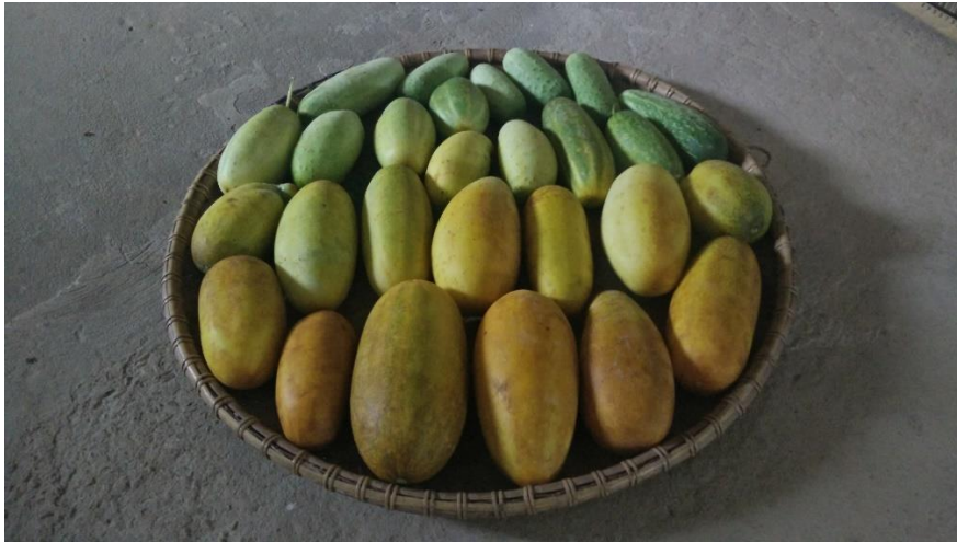
Heirloom cucumbers - tastes more like a bland juicy melon