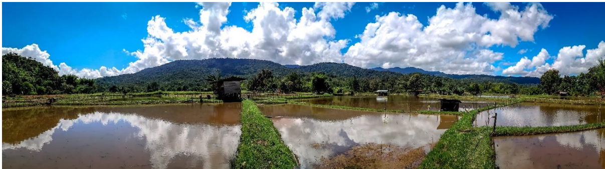
Wet paddy fields of Long Semadoh

The general path of progression for the Lun Bawang community and by extension to a lot of indigenous communities in Sarawak seems to be: