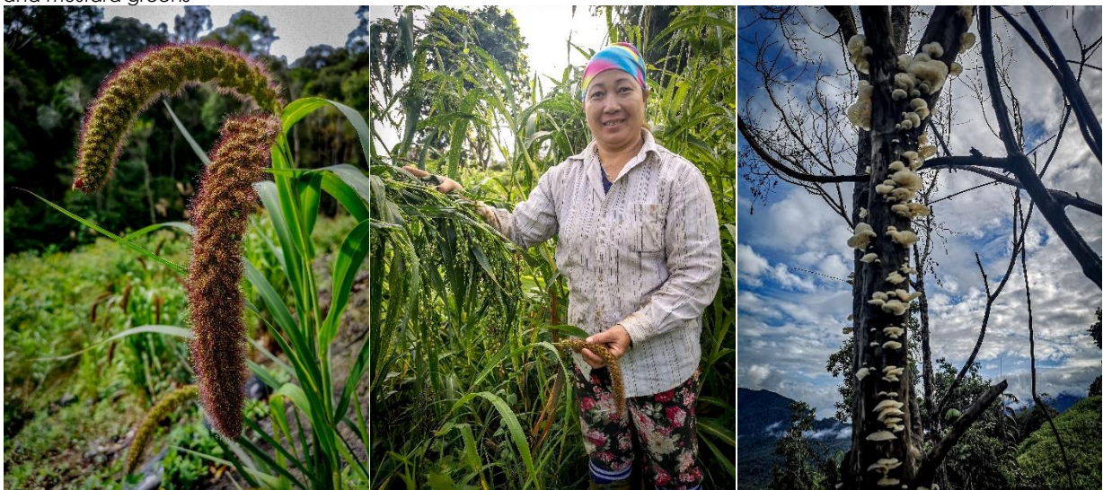
Left: Heirloom foxtail millet