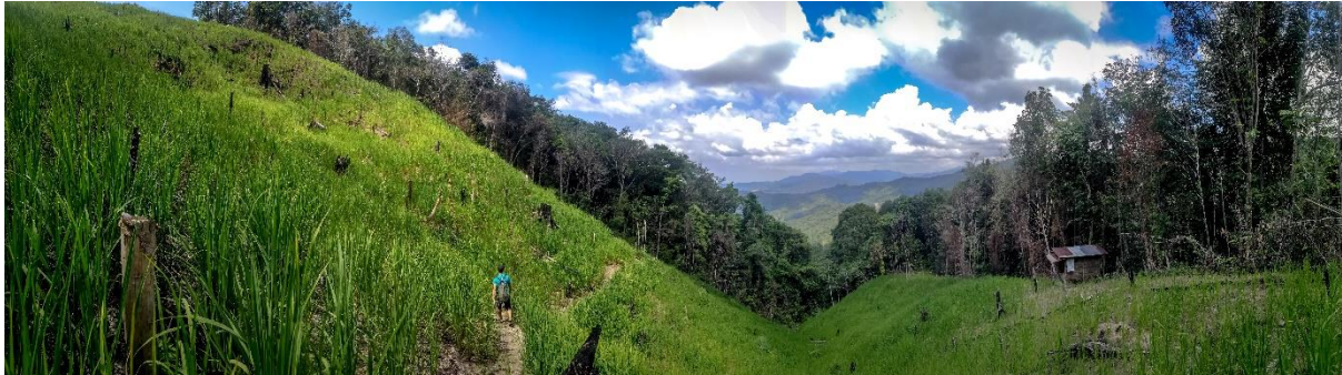
Swidden - hill paddy

The Lun Bawang community of Long Semadoh started to transition en masse from hill paddy to wet paddy cultivation about 70+ years ago.