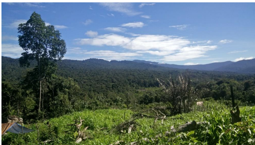
Swidden fields of heirloom crops – corn, cucumber, job's tears, mustard greens